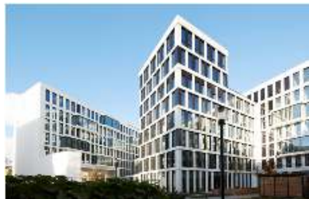
Stresemannstrasse 69, Berlin, Germany

office space in a central location close to Potsdamer Platz. The entire building is leased for ten years to a state institution that supports the implementation of the German government's development programmes in the area of environmental, nature and climate protection.