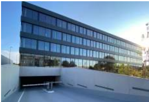
Kornwestheimerstrasse 49, Kornal-Münchingen, Germany

In Antwerp (Belgium), the fund acquired an office property that is let for nine years to one of the leading Belgian insurance companies. This insurer has been in the regional head office building since 2006. The tenant's credit rating is first class. The property comprises some 9300 square metres of office space on four very bright upper floors and is "BREEAM very good" certified.