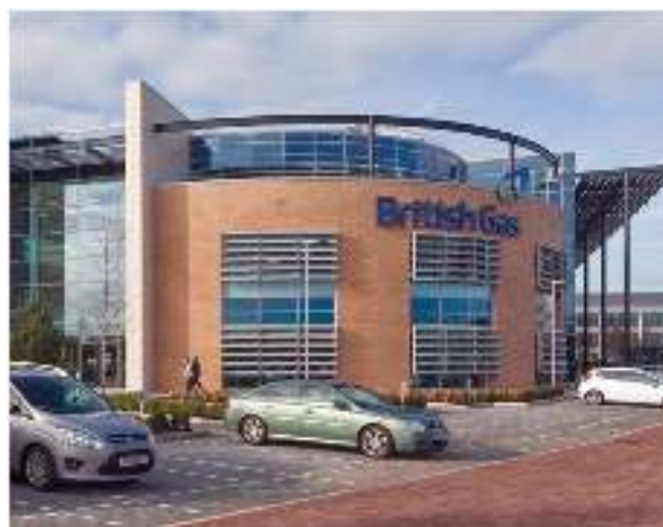
2600 John Smith Drive, Oxford, United Kingdom

In January 2022, the fund was able to sell the office property in Oxford (UK) at a very attractive price in a successfully run bidding process. The building was acquired at the beginning of February 2018 for approximately GBP 35 million (net). The sole tenant recently left the building following internal restructuring but will continue to pay rent until the lease expires in 2027. The fund benefited from the bona fide boom in the life sciences sector with a sales price more than 60% above the last external valuation.