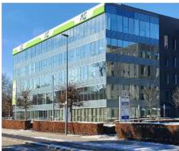
Berchemstadionstraat 70, Antwerp, Belgium

In Antwerp (Belgium), the fund acquired an office property that is let for nine years to one of the leading Belgian insurance companies. This insurer has been in the regional head office building since 2006. The tenant's credit rating is first class. The property comprises some 9300 square metres of office space on four very bright upper floors and is "BREEAM very good" certified.