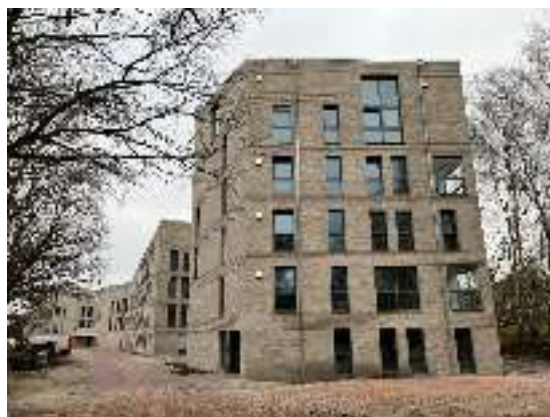
Nordmoslesfehner Strasse 1-9, Oldenburg, Germany

The residential development project in Oldenburg (Germany) was completed at the end of 2021 and transferred to the fund. The 73 apartments are located in several buildings close to nature next to a river. The letting is proceeding very well, in spite of the work on the outdoor greenery not having yet been completed. The apartments have attractive and very individual floor plans with high ceilings and high-quality fittings.